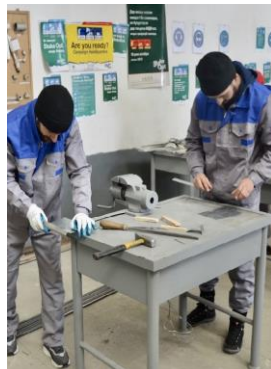
Students are at work in the lab at Khorog SPCE campus